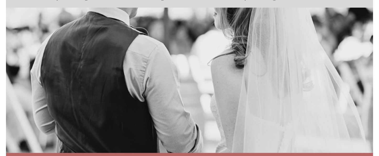
Husbands, love your wives, as Christ loved the church and gave himself up for her, that he might sanctify her, having cleansed her by the washing of water with the word.